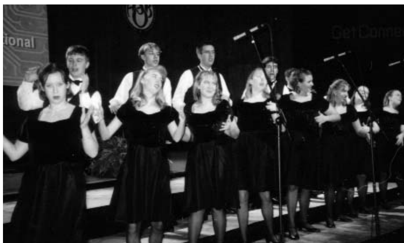
The Chesapeake Senior High Vocal Ensemble, (Anne Arundel County) is shown performing at a General Session at the ASBO International Conference. Centennial High School Jazz Band (Howard County) and the Arundel Senior High Jazz Band (Anne Arundel County) performed at other sessions..