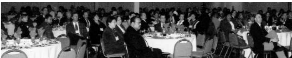
Luncheon Session at Turf Valley Resort & Conference Center, December 8, 2000.